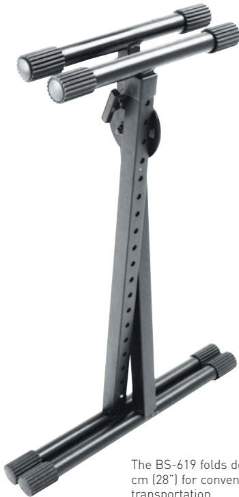
The BS-619 folds down to only 71 cm (28") for convenient storage and transportation